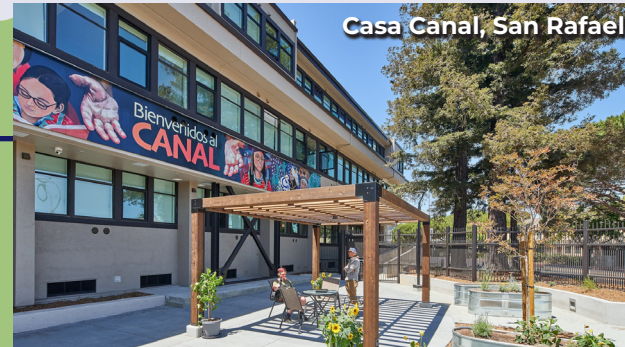
Casa Canal, San Rafael