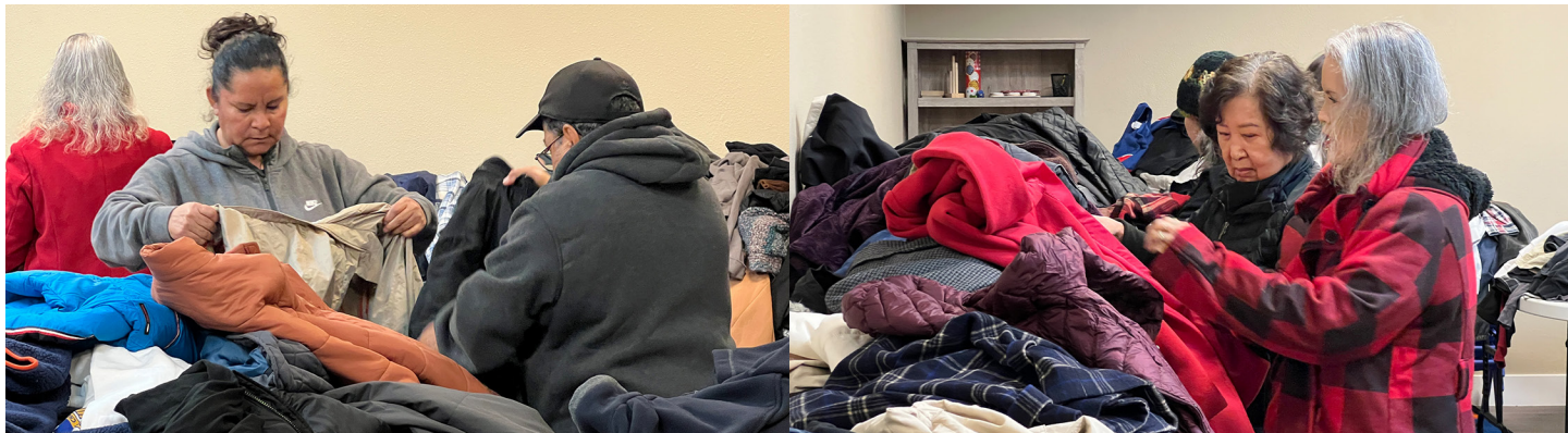
For the winter holidays, Eden Housing organized a One Warm Coat donation drive. Collectively, we raised $1,532 and donated over 1,300 coats to Eden residents.