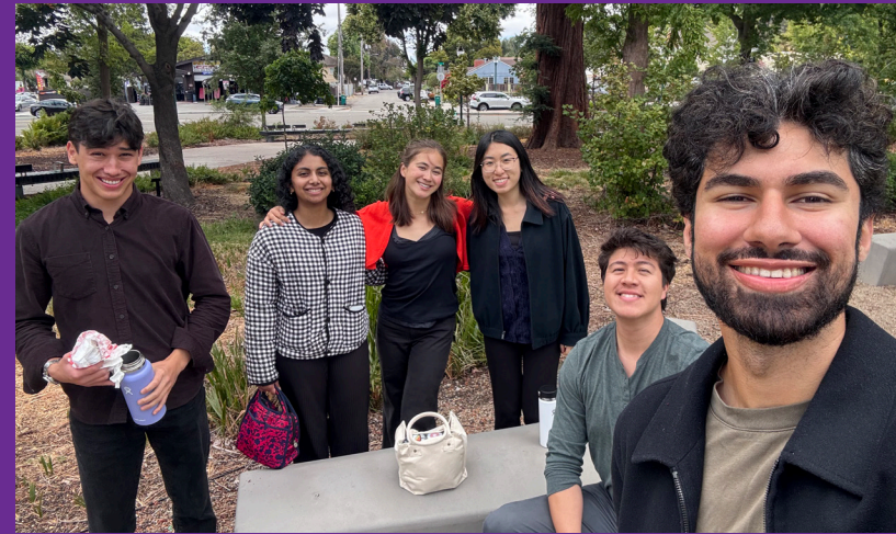
Focused on growing new talent in the industry with Project Destined and other internship programs

Hired Vice-President of Culture and Engagement