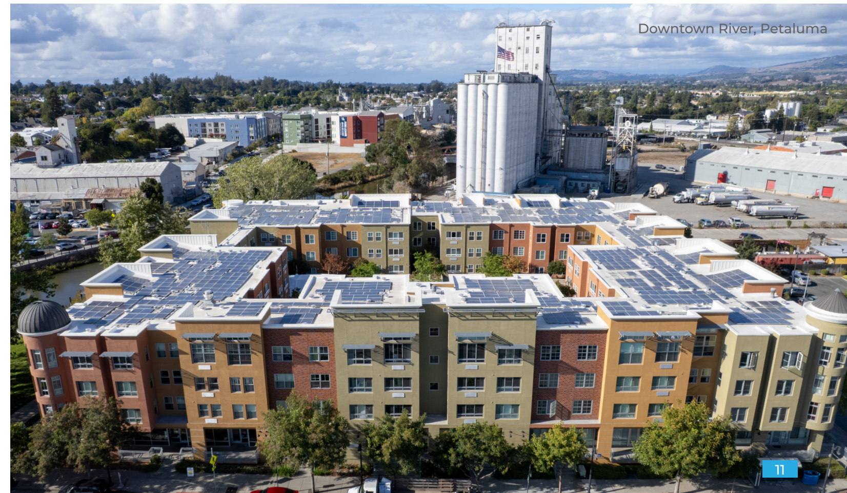
Downtown River, Petaluma

Launched first AI-enabled Knowledge Management System