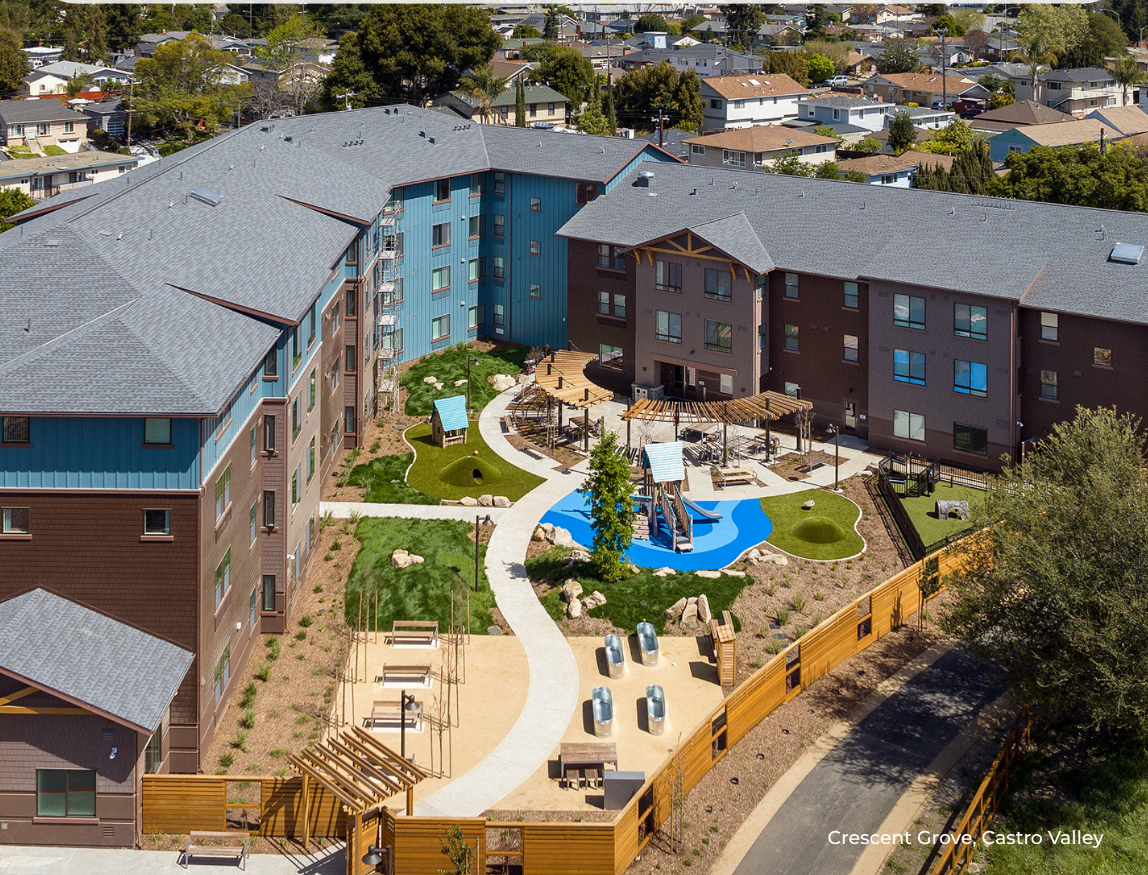
Crescent Grove, Castro Valley