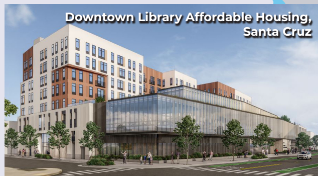
Downtown Library Affordable Housing, Santa Cruz