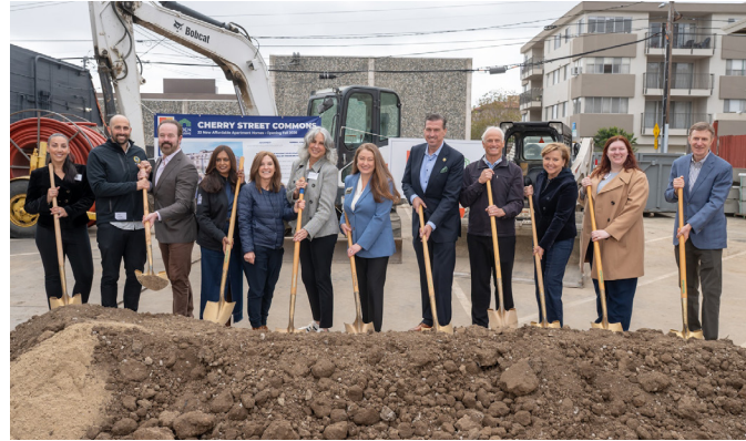
Collaborated with community partners to drive collective impact