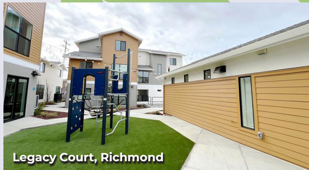
Legacy Court, Richmond