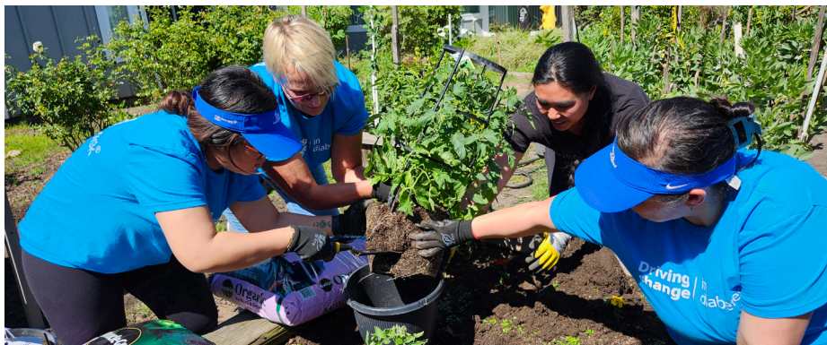
Life Science Cares Bay Area and Novo Nordisk volunteered at Josephine Lum Lodge