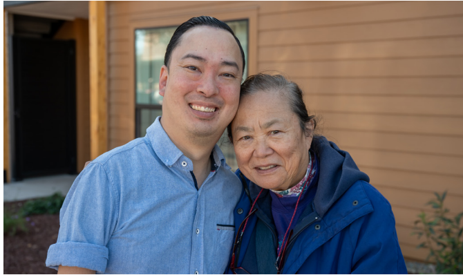
Refined Eden Housing's mission and core values