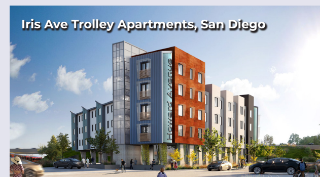
Iris Ave Trolley Apartments, San Diego