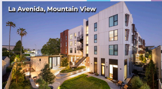
La Avenida, Mountain View